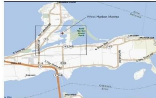
West Harbor Marina "Minutes east of Port Clinton"