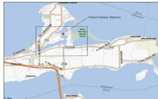
West Harbor Marina “Minutes east of Port Clinton”